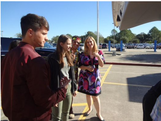
Delivery at Clear Springs High School