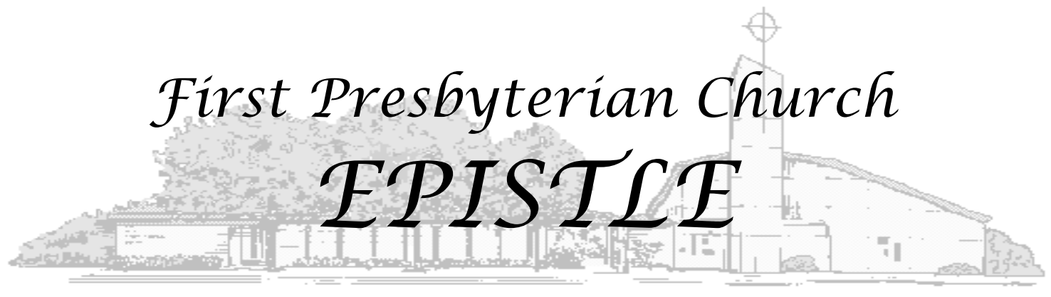
Our Mission: Connecting with God and sharing the Good News of Jesus Christ with the community. May 2010 Vol. 1 & No. 5