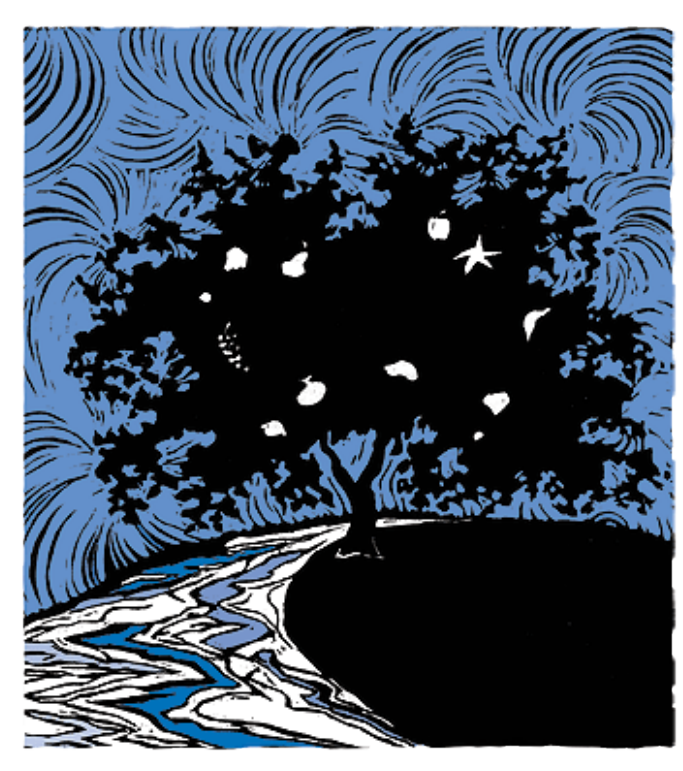
2010–2011 Horizons Bible Study.