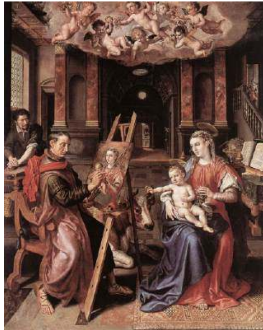
St. Luke Painting the Virgin, 1602, by Maarten de Vos, Koninklijk Museum voor Schone Kunsten, Antwerp

The other day I saw a picture by an artist named Maarten de Vos called St. Luke Painting the Virgin and discovered that legend has it that Luke was an artist. I read that there are seven paintings attributed to him. After spending several weeks with the stories in Luke's Gospel, that legend does not surprise me. He paints vivid pictures with the words of the stories we have studied. Don't you feel like you have walked the road with Jesus thus far?