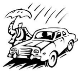
Parking Lot Attendants

FPCD has a need for Parking lot Attendants. This is someone who can help those in wheelchairs or walkers get from their vehicles to the sanctuary & then back to their vehicles after the service. The attendant would also greet new 1 st time visitors & direct them to the sanctuary. A sign up sheet for each Sunday has been placed on the Kiosk. Please sign up for one of these Sunday's & be near the Fellowship Hall side doors no later than 10:15am.